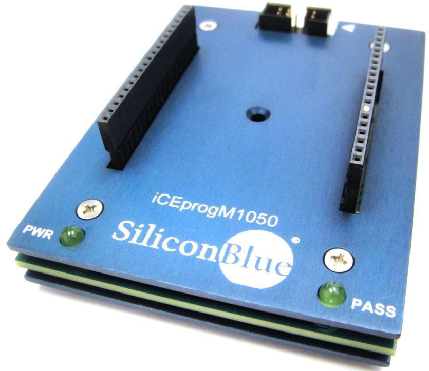
Figure 1: iCEprogM1050-01