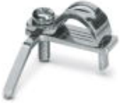
Shield connection clamp for printed circuit terminal block

Components of electronic housing - ME-SAS - 2853899