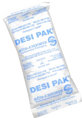
13843 & 13844

In order to provide a complete moisture barrier packaging assembly, desiccant must be inserted into the bag, prior to having the bag vacuum sealed. The recommended amount of desiccant is dependent on the interior surface area of the bag to be used. Figure 4 is a reference table indicating recommended minimum amounts of desiccant that should be used with Moisture Barrier Bags.