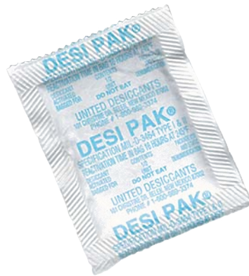
13840 & 13850

"...it is important to take possible temperature exposure into account when shipping electronic parts. It is particularly important to consider what happens to the interior of a package if the environment has high humidity. If the temperature varies across the dew point of the established interior environment of the package, condensation may occur. The interior of a package should either contain desiccant or the air should be evacuated from the package during the sealing process. The package itself should have a low WVTR." (ESD Handbook ESD TR20.20 section 5.4.3.2.2)