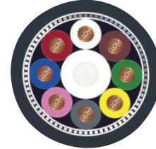
PUR halogen-free black shielded [PUR]