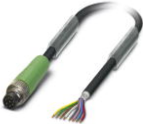
Sensor/Actuator cable, 8-position, PUR, Black RAL 9005, shielded, Plug straight M8, on Free cable end, Cable length: 5 m

Please be informed that the data shown in this PDF Document is generated from our Online Catalog. Please find the complete data in the user's documentation. Our General Terms of Use for Downloads are valid ( http://download.phoenixcontact.com )