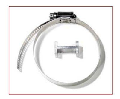
Outdoor Mounting Kit