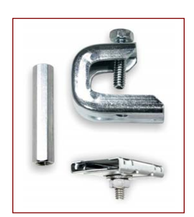
Indoor Mounting Kit

Cut perpendicular to the antenna along the cable axis