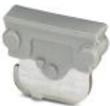
Spare knife, Length: 10.5 mm, Width: 4 mm, Color: gray