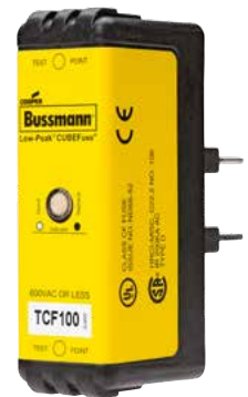
Indicating time-delay CUBEFuse.