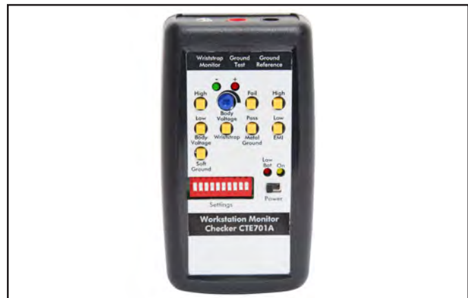
Figure 3. SCS CTE701 Workstation Monitor Checker

The checker verifies the proper operation of dual wrist strap monitoring. Connect a 3.5 mm test cable to both the checker and to the operator jack of the monitor. At this point the monitor should indicate failure. Depress the Pass button on the wrist strap section. The monitor should indicate a good connection. While pressing the Pass button, press body voltage “high.” At this point the Wrist Strap LED would be blinking red.