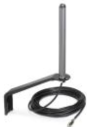
GSM-UMTS omnidirectional antenna, 2 dBi gain, 5 m antenna cable with SMA circular connector

Please be informed that the data shown in this PDF Document is generated from our Online Catalog. Please find the complete data in the user's documentation. Our General Terms of Use for Downloads are valid ( http://phoenixcontact.com/download )