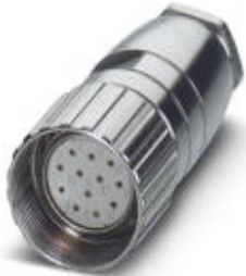
Cable connector, with Pg9 connection thread, straight, shielded: no, Screw locking, M23, No. of pos.: 7, type of contact: Socket, Solder connection, cable diameter range: 6 mm ... 10 mm

Please be informed that the data shown in this PDF Document is generated from our Online Catalog. Please find the complete data in the user's documentation. Our General Terms of Use for Downloads are valid ( http://phoenixcontact.com/download )