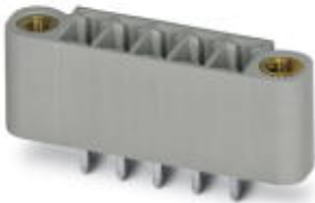
The figure shows the 5-pos. version of the product in gray

Header, Nominal current: 8 A, Rated voltage (III/2): 160 V, Number of positions: 18, Pitch: 3.5 mm, Color: black, Contact surface: Tin, Mounting: Wave soldering