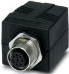
Control cabinet feed-through, M12, 8-pos., A-coded on RJ45 socket, socket input 180°, IP65/67

Please be informed that the data shown in this PDF Document is generated from our Online Catalog. Please find the complete data in the user's documentation. Our General Terms of Use for Downloads are valid ( http://download.phoenixcontact.com )