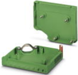
Cable housing, Pitch: 0 mm, Number of positions: 7, Dimension a: 55.14 mm, Color: green

Please be informed that the data shown in this PDF Document is generated from our Online Catalog. Please find the complete data in the user's documentation. Our General Terms of Use for Downloads are valid ( http://phoenixcontact.com/download )