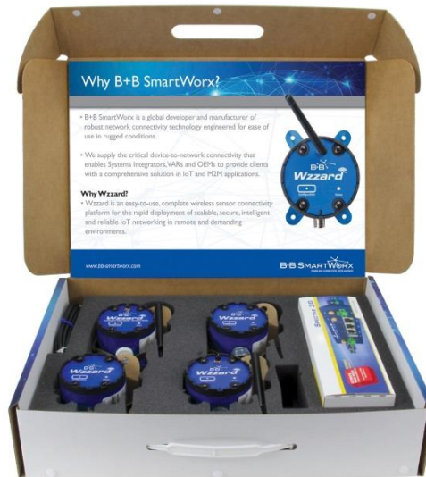
Figure 1. Wzzard Development Kit

There are four versions of the Wzzard design and development kit. Three versions of the kit provide a 3G or LTE cellular connection and an Ethernet network connection. The other provides an Ethernet network connection. The kits include a Spectre Network Gateway, an M12 cable harness and (4) Intelligent Edge Nodes. (Additional Nodes may be purchased to build a larger network). The Nodes provide the sensor interface connection to all of the options provided by the Wzzard system; analog input, digital input, integrated accelerometer and thermocouple input. All Nodes also contain an integrated temperature sensor. Nodes have multiple cabling options: conduit fitting and M12 connections. Sensor cable harnesses are also provided for connection to either the M12 connector or for conduit connections. Additionally, two of the Nodes are supplied with external antennas and two with internal antennas, allowing you to test for range with both options. Each node comes with 2 AA Li-ion batteries. Kit contents are described below: