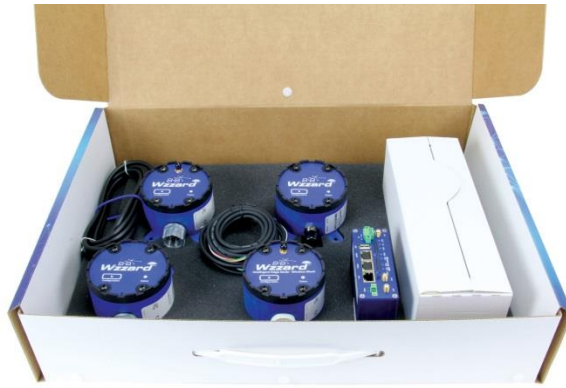
Figure 2. Repackaging the Kit