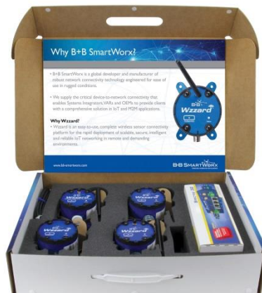
Figure 1. Kit Contents

The Wzzard Design and Development Kits come in a handy enclosure. The package as shipped is shown below: