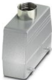
HEAVYCON sleeve housing HV10/16, for double locking latch, height 76 mm, with support 1x M25, straight conductor exit

Please be informed that the data shown in this PDF Document is generated from our Online Catalog. Please find the complete data in the user's documentation. Our General Terms of Use for Downloads are valid ( http://phoenixcontact.com/download )