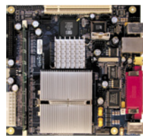
Custom Form Factor/ Mini-ITX SBC

Single Board Computer: » Fits standard Mini-ITX form factor » Design Custom SBC to fit your product form factor