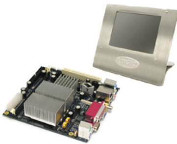
Logic Development Board / SBC (with Display Kit)

Development Board simplifies: » Application specific code development » Evaluation of the Geode MPU » Transfer of Code/OS/Drivers into production