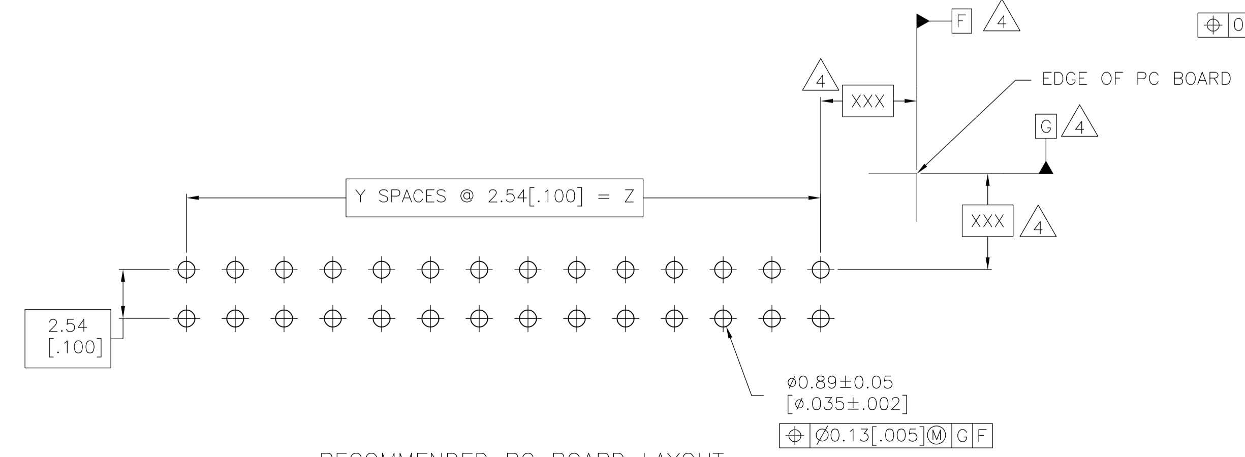
RECOMMENDED PC BOARD LAYOUT 1.57[.062] PC BOARD VIEWED FROM CONNECTOR SIDE