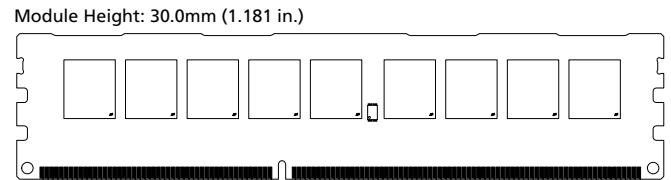
Figure 1: 240-Pin UDIMM (MO-269 R/C E)