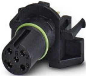
Sensor/actuator flush-type socket, 5-pos., A-coded, with straight solder connection, only contact insert

Please be informed that the data shown in this PDF Document is generated from our Online Catalog. Please find the complete data in the user's documentation. Our General Terms of Use for Downloads are valid ( http://download.phoenixcontact.com )