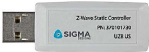
U2B USB Stick Bridge