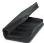
Tool box, empty

Tool bag - TOOL-KIT STANDARD EMPTY - 1212423