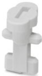
Locking element for locking the PCB onto UM-BASIC/PRO housing at level 3

Please be informed that the data shown in this PDF Document is generated from our Online Catalog. Please find the complete data in the user's documentation. Our General Terms of Use for Downloads are valid ( http://phoenixcontact.com/download )