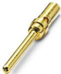
D-SUB crimp contact, contact inserts: x , connection method: Crimp connection, connection cross section: AWG 24- 20

Please be informed that the data shown in this PDF Document is generated from our Online Catalog. Please find the complete data in the user's documentation. Our General Terms of Use for Downloads are valid ( http://phoenixcontact.com/download )