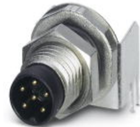
Sensor/actuator flush-type plug-in connector, plug, 6-pos., M8, rear/screw mounting with M8 fastening thread, with angled solder connection

Please be informed that the data shown in this PDF Document is generated from our Online Catalog. Please find the complete data in the user's documentation. Our General Terms of Use for Downloads are valid ( http://download.phoenixcontact.com )