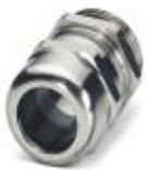
Cable gland, Cable gland material: Brass, nickel-plated, External cable diameter 10 mm ... 14 mm, Shielding: No, Connecting thread: Pg16, Color: silver

Cable gland - G-INS-PG16-S68N-NNES-S - 1411174