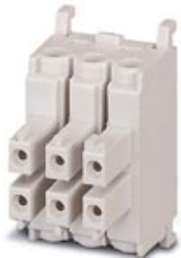
Contact insert module, for sleeve frames, with screw connection, 5-pos. + PE connection, 250 V / 10 A

Please be informed that the data shown in this PDF Document is generated from our Online Catalog. Please find the complete data in the user's documentation. Our General Terms of Use for Downloads are valid ( http://download.phoenixcontact.com )