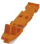
Latching, Width: 5.2 mm, Length: 3 mm, Number of positions: 2, Color: orange