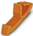
Latching, Number of positions: 1, Color: orange