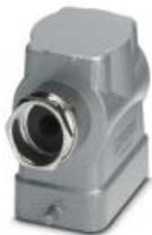
HEAVYCON B6 sleeve housing, for single locking latch, height: 72 mm, with 1 x Pg21 screw connection, lateral cable outlet

Please be informed that the data shown in this PDF Document is generated from our Online Catalog. Please find the complete data in the user's documentation. Our General Terms of Use for Downloads are valid ( http://phoenixcontact.com/download )