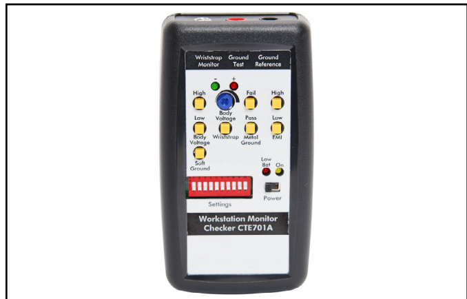
Figure 3. SCS CTE701 Workstation Monitor Checker

The checker verifies the proper operation of dual wrist strap monitoring. Connect a 3.5 mm test cable to both the checker and to the operator jack of the monitor. At this point the monitor should indicate failure. Depress the Pass button on the wrist strap section. The monitor should indicate a good connection. While pressing the Pass button, press body voltage “high.” At this point the Wrist Strap LED would be blinking red.