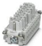
HEAVYCON female insert, B16 series, 16-pos., screw connection

Contact insert - HC-B 16-I-UT-F - 1648241