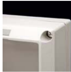
The lid fastening screws are located on the backside of the base