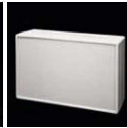
The entire front can be used for mounting keypads, switches, displays etc.

Exactly what you are looking for??? Link to our stocking distributors - most have "on-line" pricing, stock check and ordering!!!