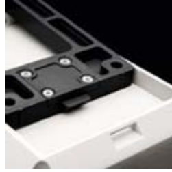
A recess on the bottom of the enclosure locates the snap-on device (invisible from the front)