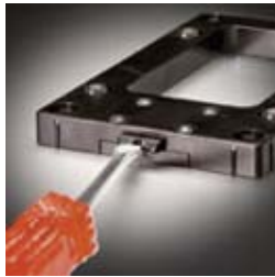
Snap-on device with spring loaded latch