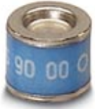
Reserve gas-filled surge arrester for RF-TRAB

Please be informed that the data shown in this PDF Document is generated from our Online Catalog. Please find the complete data in the user's documentation. Our General Terms of Use for Downloads are valid ( http://phoenixcontact.com/download )