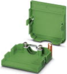
Cable housing, Pitch: 3.81 mm, Number of positions: 13, Dimension a: 51.92 mm, Color: green

Please be informed that the data shown in this PDF Document is generated from our Online Catalog. Please find the complete data in the user's documentation. Our General Terms of Use for Downloads are valid ( http://phoenixcontact.com/download )