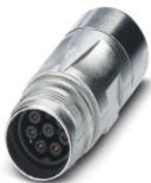
Coupler connector, straight, SPEEDCON locking, M17, Number of positions: 5+3+PE, Type of contact: Socket, Crimp connection, shielded: yes, Cable diameter: 3.5 mm...5.5 mm

Please be informed that the data shown in this PDF Document is generated from our Online Catalog. Please find the complete data in the user's documentation. Our General Terms of Use for Downloads are valid ( http://phoenixcontact.com/download )